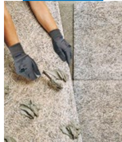
Laying heavy insulation panels