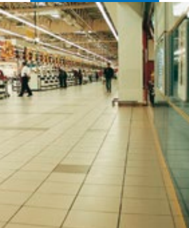
An example of an installation with Keraquick S1 in an Auchan supermarket - Sosnowiec (Poland)