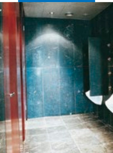
An example of the installation of marble to walls with Keraquick S1 - Feuchtwangen casinò bathroom (Germany)