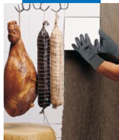
Repair work in a refrigerator unit