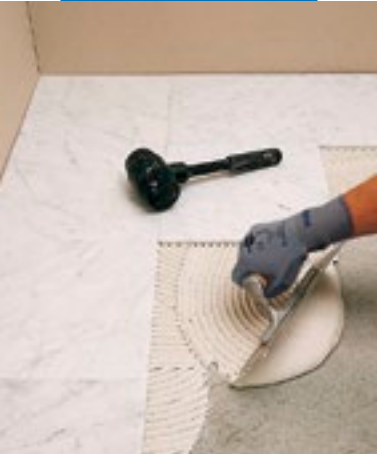
Setting white Carrara marble with Keraquick S1 white

Expansion joints must be sealed with the special MAPEI sealants.